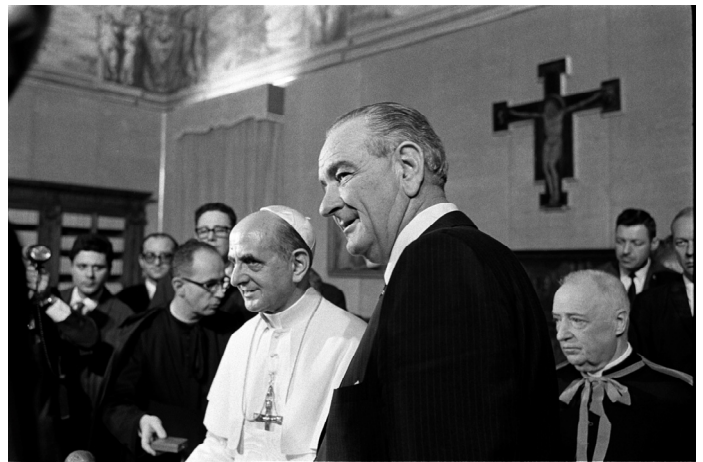
Pope Paul VI with LBJ (1967)