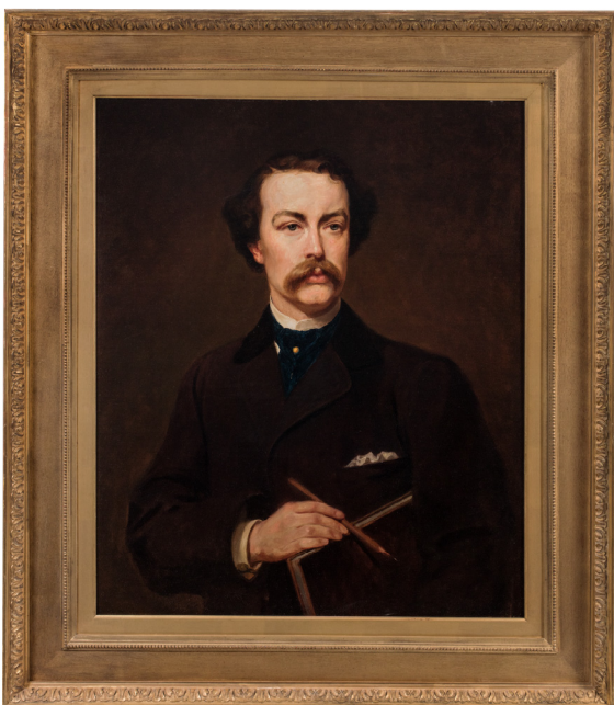
G.P.A. Healy, Portrait of William Stanley Haseltine (1871), oil on canvas, 76.2x63.2cms, The New York Historical, 2022.21