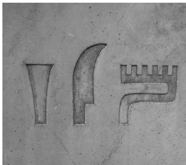
'Hieroglyphs' on the reverse.