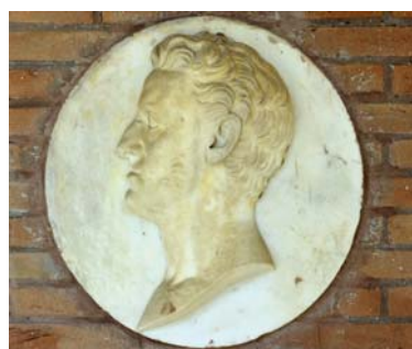
August von Goethe, 1831, marble