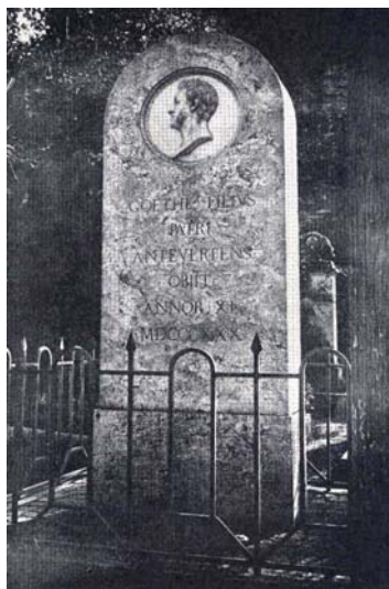
Grave of August von Goethe, with marble medallion, undated (Non-Catholic Cemetery in Rome)