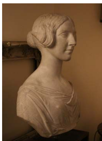
Female bust, 1840 (author's collection)

Recent conservation work has revealed the colours of the three different materials (Bardiglio and Carrara marbles and travertine), and the way they come together harmoniously, showing the high technical and aesthetical standards applied in this work of art.