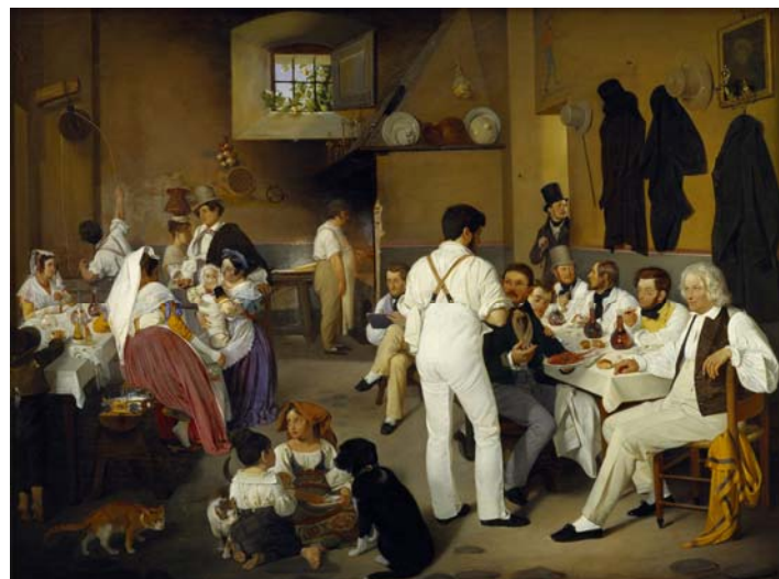
Ditlev Blunck, Danish artists at the Osteria La Gensola in Rome , 1837, oil on canvas, Thorvaldsens Museum. Thorvaldsen sits at the near right in a Trastevere trattoria still in operation today.

Many visitors, especially Germans, head directly for the grave of the son of Germany's most famous poet, Johann Wolfgang von Goethe. On their way there, in the same row, they pass the grave of another German, the painter Heinrich Reinhold, who died of tuberculosis in 1825 aged 36 (Zone 1.14.5). The two young Germans share the distinction of having inset into their headstones a portrait-medallion designed by the great Danish sculptor, Bertel Thorvaldsen (1770-1844).