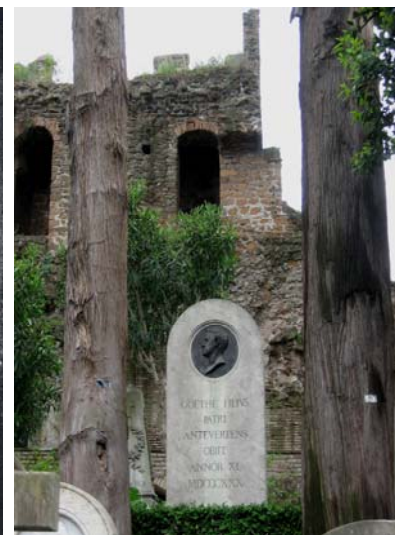
Cypress trees flanking the grave